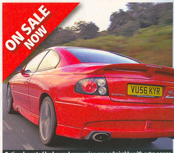
Optional up-rated brakes and suspension cope admirably with extra power