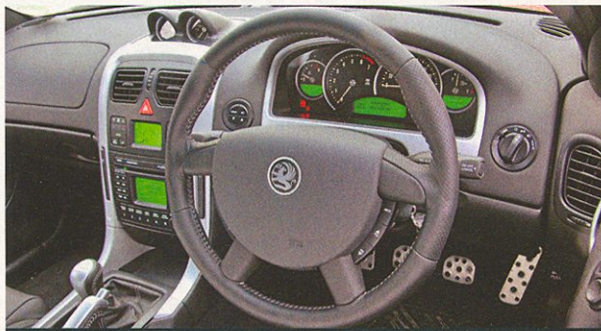
Drilled pedals inside among the few clues to Monaro's true potential

At a glance OUR VXR 500 test car could be heard coming from miles away. It was fitted with an optional sports exhaust system (£960), which is well worth the money. Popping and gurgling on the over-run, it's up there with TVRs as far as acoustic sessions go!